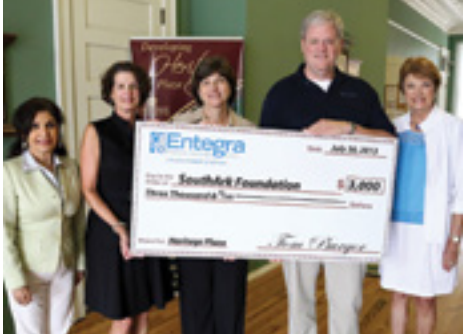
Entegra-Union Power Partners recently donated $3,000 to benefit Heritage Plaza.