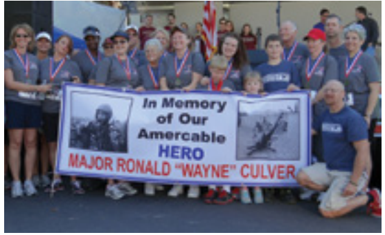
Nexans Amercable, 5K sponsor, donated $6,000 to toward the SouthArk Outdoor Expo fundraising effort.