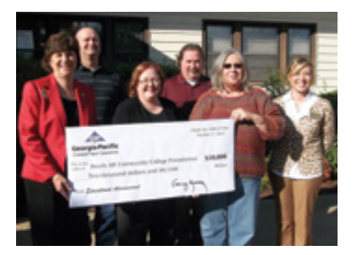
Georgia-Pacific Crossett Paper Operations recently donated $10,000 to benefit the process technology program.