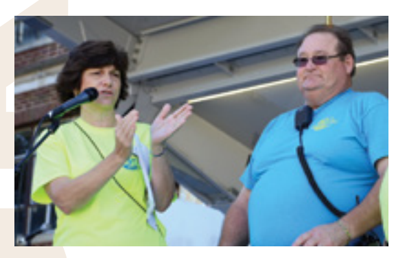
El Dorado Chemical donated $4,200 toward the SouthArk Outdoor Expo fundraising effort.