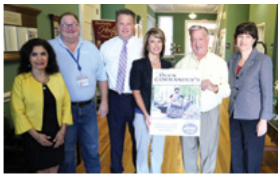
Herring Furniture, rib cookoff sponsor, donated $5,000 toward the SouthArk Outdoor Expo fundraising effort.