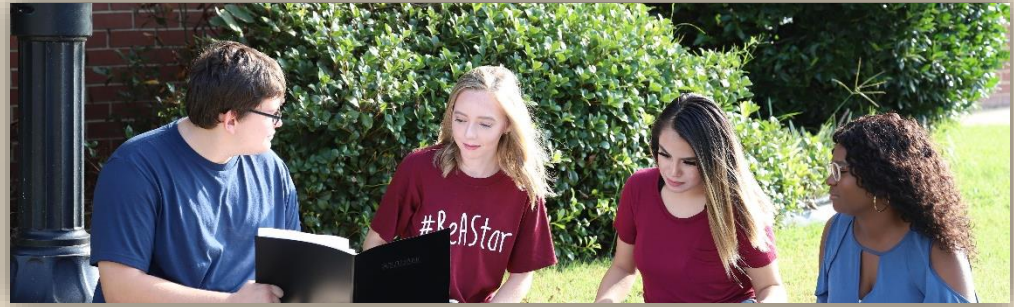
Fall to Fall Retention