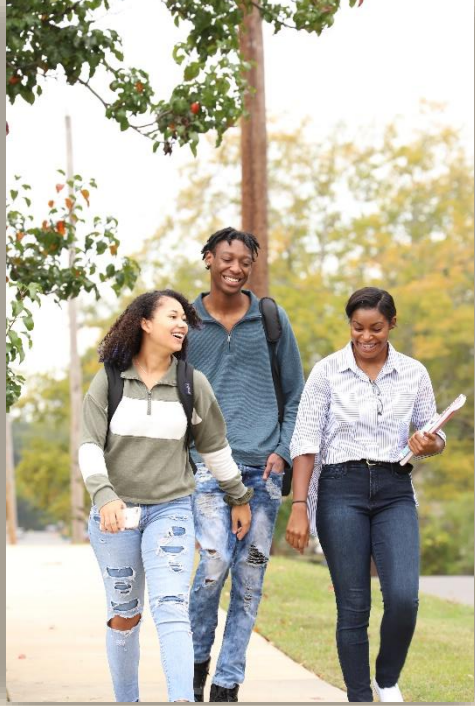
Percentage of all students receiving aid